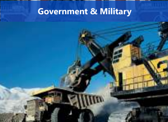
Materials & Mining