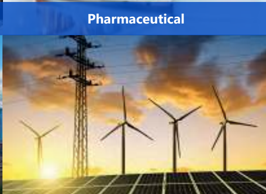
Utilities & Energy