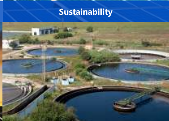
Water & Wastewater